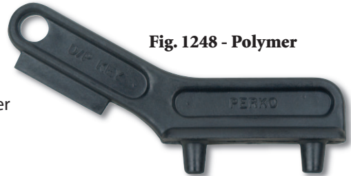
Fig. 1248 - Polymer