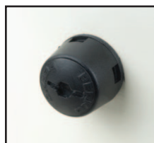
Style 1 Mounted

Fig 0592 Spare Splash Guard Style 1: Black - Cat. No. 0592B1099A, White - Cat. No. 0592W1099A Fig 0592 Spare Splash Guard Style 2: Black - Cat. No. 0592B2099A, White - Cat. No. 0592W2099A