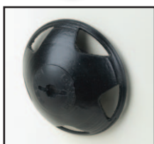
Style 2 Mounted